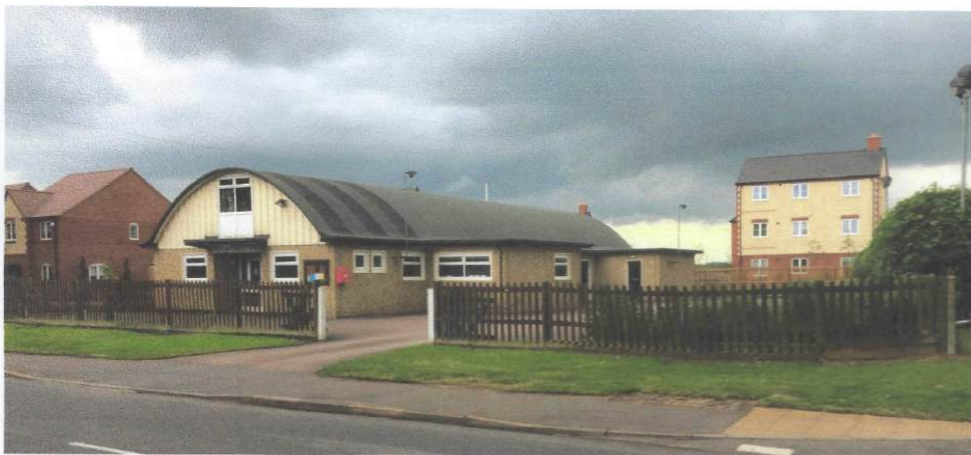
The Tiddington Community Centre