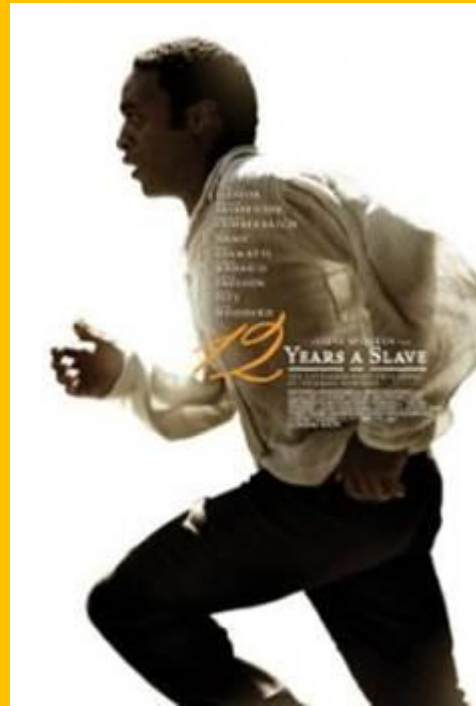
12 Years a Slave