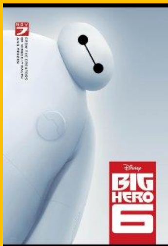
Big Hero 6