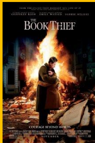
The Book Thief

Big Hero 6 (2014) PG | 102 min | Animation, Action, Adventure |