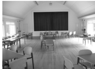
New Meeting Room