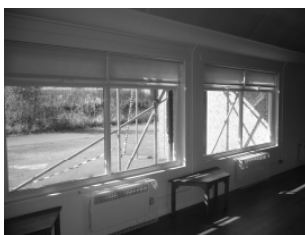
New Electrics, Heating, Lighting, new Chairs